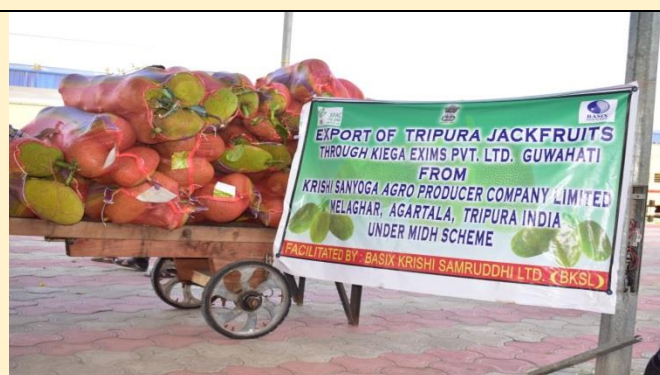
At Agartala Railway Station - Ready for loading in train for Guwahati