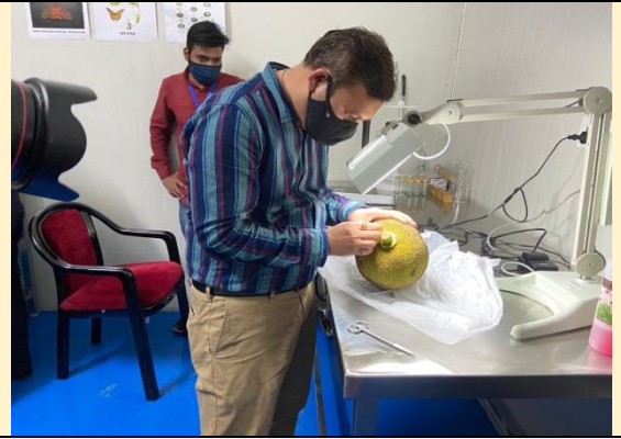
Plant Quarantine Inspection at Guwahati