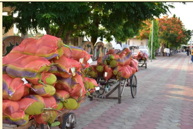
Being transported to Agartala Railway station